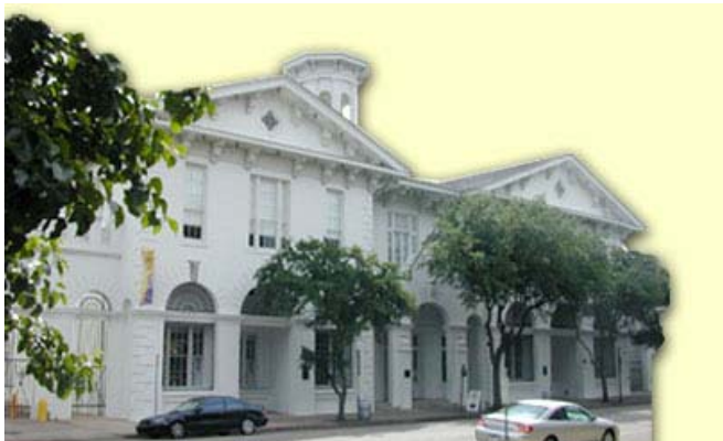
The Museum of Mobile located in Mobile, Alabama

When the California Foundry History Institute was established, one of its fundamental goals was to be a resource of information and education to the community. We continue to fulfill this goal when we welcome the public to our museums, when we provide information to individuals conducting research, and when we collaborate with other educational institutions.